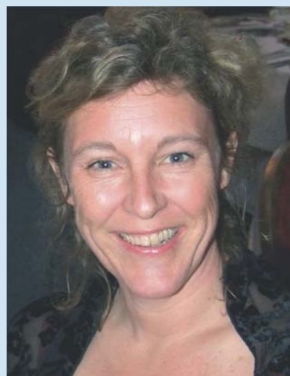
Jess Williams Foundation Trust Project Director