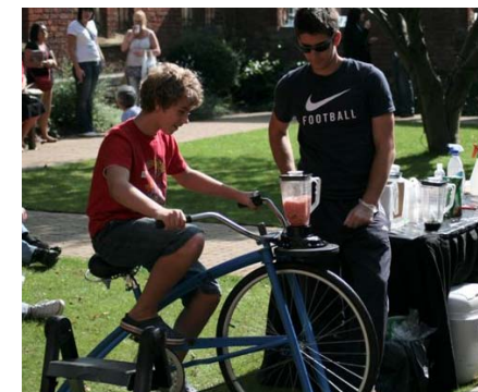
The smoothie bike

City's Beat the Goalie, free healthy snacks, a pampering corner and good health stalls to highlight the benefits that a healthy lifestyle can have on mental wellbeing.