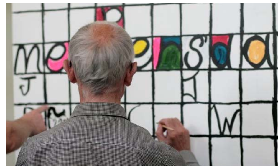
The painting wall workshop

Though the focus of the event was to get our members together and have fun there was also a serious underlying public health message.